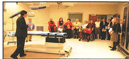
Visitors learning about new surgery equipment during the St. Clair grand opening.

The new St. Vincent's St. Clair offers patients access to the best diagnostic equipment. The hospital has a completely upgraded 1.5T MRI, the leading standard in imaging technology nationwide, and a 64-slice CT scanner with the fastest scan time available. The mammography department is fully digital, providing physicians with more accurate images and faster transmission time.