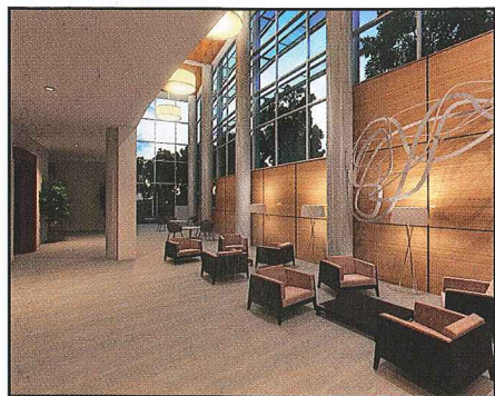
Architect rendering of interior lobby area with ample natural light

St. Vincent's Foundation has set a fundraising goal of $8.7 million to help build the new Bruno Cancer Center. This amount will be a large portion of the funds needed to give our patients updated facilities and technology. As in our past campaigns, we are depending on the generosity of our donors to make this new center a reality. Already, we have collected more than $2.5 million from donors and foundations who are committed to this cause. We are excited to see how others will step up to this challenge and assist us in caring for each patient who counts on St. Vincent's for cancer care.