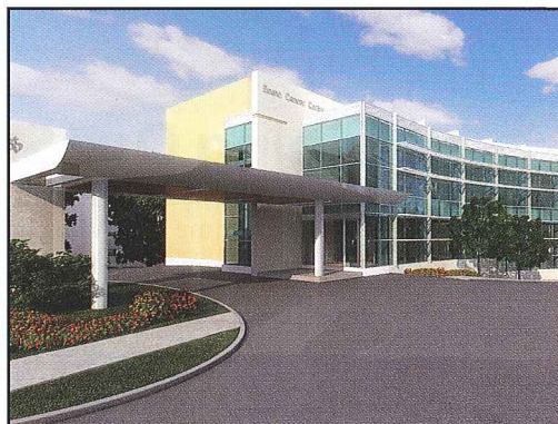
Architect rendering of front entrance with covered drop-off area

The new Bruno Cancer Center will be a spacious, three to four-story facility that will house radiation, medical and gynecological oncology all in one place. Patients will have more room for privacy in dressing rooms, examination rooms and treatment vaults. Waiting areas and walkways will be less cramped and more comfortable for all visitors. New amenities will be added to better serve patient and family needs, including a meditation room and café.